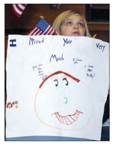
A long time of waiting ends for many 173rd families & troops.